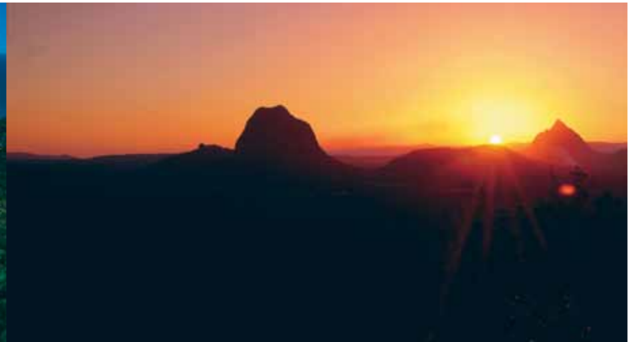
The Glass House Mountains at Sunset

The Sunshine Coast captures the spirit of Queensland at its best. The people are laid back, the Pacific waters sparkling and the beaches plentiful and golden – with an average of 300 days of sunshine a year to enjoy them in.