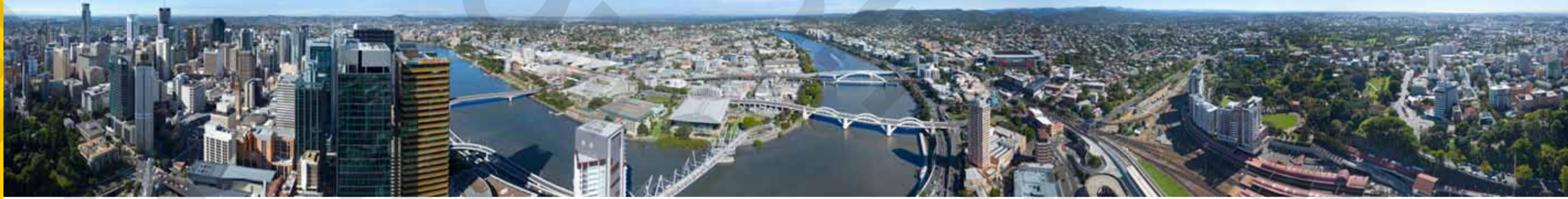
VIEW FROM LEVEL 43