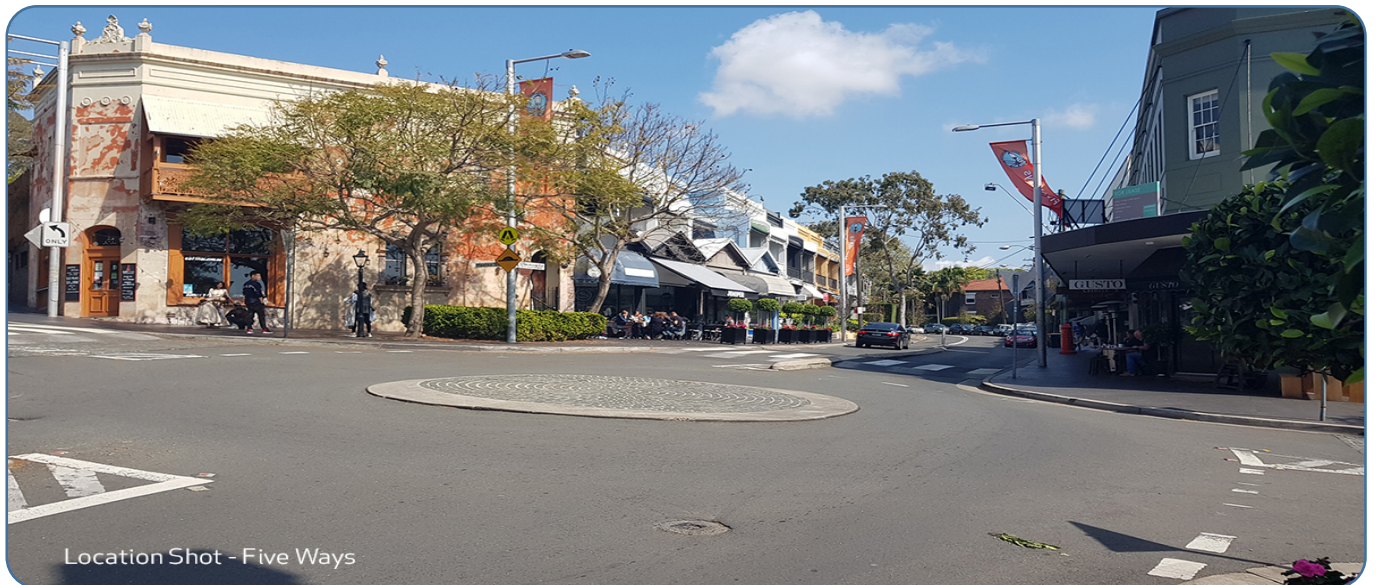
Location Shot - Five Ways

DISCLAIMER: The information in this brochure is for marketing and general information purposes only. It has, except as otherwise indicated, been supplied to us by or on behalf of the Lessor. All dimensions and areas quoted or appearing on plans are subject to survey. We have not verified the information nor have we sought to have the information independently verified. We have not formed any opinion as to its truth or falsity. We therefore recommend that potential Lessees make their own investigations and inquiries. The information in this brochure does not form part of any contract. It is not to be relied upon or used for any other purpose.