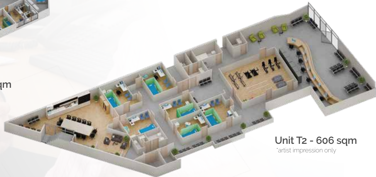
Unit T2 - 606 sqm *artist impression only