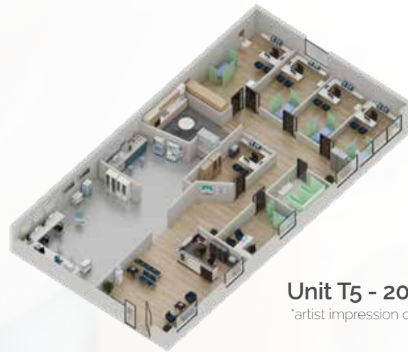
Unit T5 - 204 sqm *artist impression only

135 car parks are available onsite with the opportunity to secure exclusivity by way of a negotiated Licence Agreement to suit your requirements.