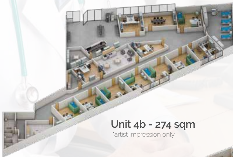
Unit 4b - 274 sqm *artist impression only