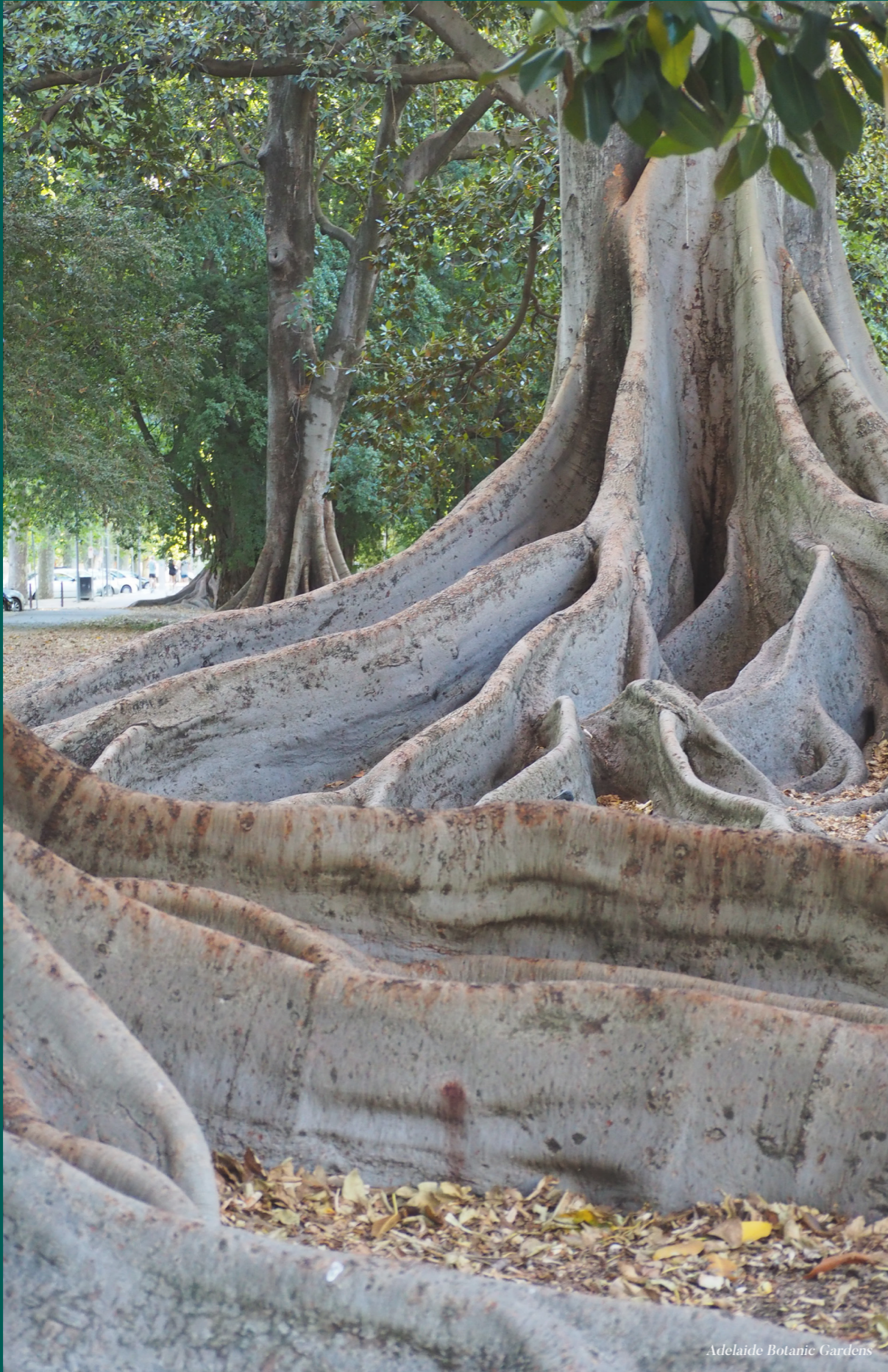
Adelaide Botanic Gardens