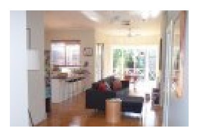
46 Imbros St HAMPTON Sold by Auction $3,325,000 Date Sold Aug 2017

These are the three properties sold within two kilometres of the property for sale in the last six months that the estate agent or agent's representative considers to be most comparable to the property for sale.