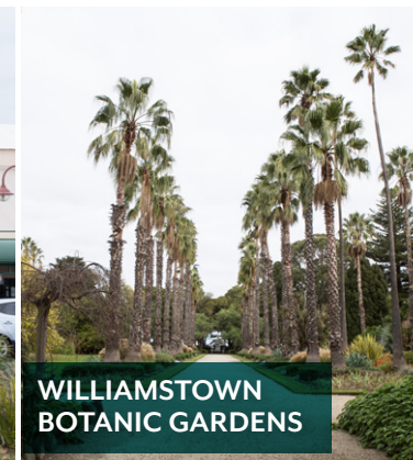
WILLIAMSTOWN BOTANIC GARDENS