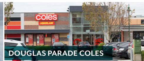
DOUGLAS PARADE COLES