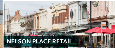
NELSON PLACE RETAIL